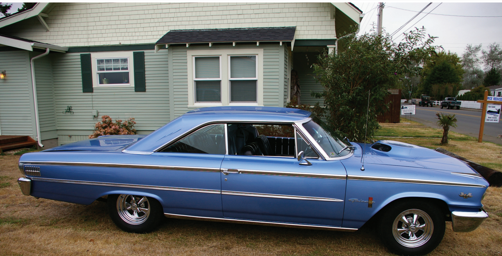
Joe DeTemple's 1963 1/2 Restored / Modified Galaxie 500 'XL' as seen in Vancouver, Washington

1962 Galaxie Convertible Roof Frame I am in Australia. Will pay top money and will organize the postage if necessary. If any one knows where